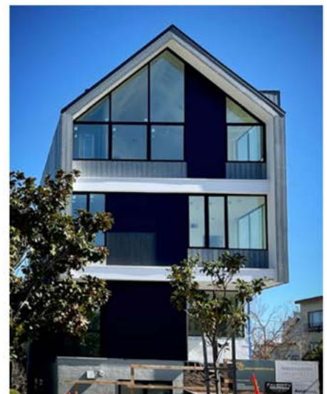
Dolores Dwelling / Winder Gibson Architects