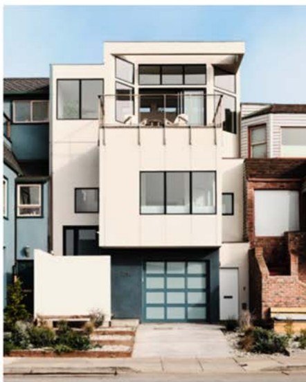
"Above the Dune" Surf House / Levy Art & Architecture