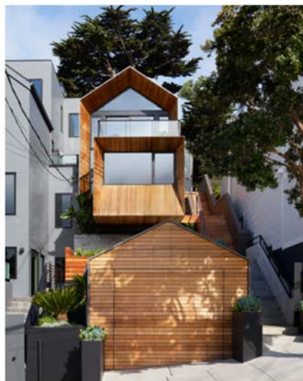
Dolores Heights / Jones Haydu / Sawyers Design